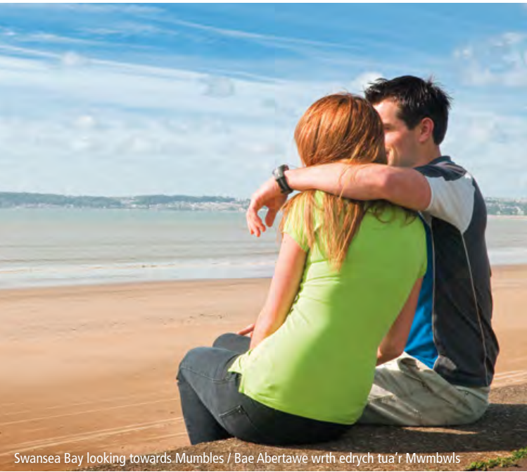
Swansea Bay looking towards Mumbles / Bae Abertawe wrth edrych tua'r Mwmbwls

The Pembrokeshire Railcard is valid for 12 months from the date of issue and will quickly pay for itself - the more you travel, the more you save!